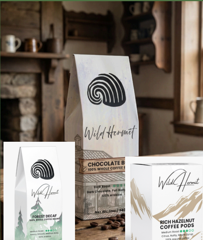
#005 ITEM I

This medium roast blend combines Brazilian beans for body and chocolate depth with Mexican varietals that add balance and a clean, citrusy edge. The Brazilian Catucaí, Catucaí, and Mundo Novo varietals bring the classic, rich coffee taste, while the Mexican Bourbon and Typica varietals provide bright structure and sweetness. The result is a cup that stands out from the usual pod lineup. (Pict. Item K)