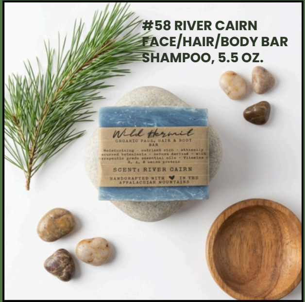
#58 RIVER CAIRN FACE/HAIR/BODY BAR SHAMPOO, 5.5 OZ.