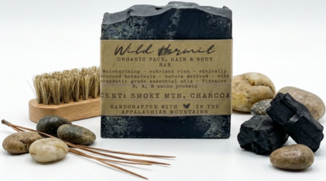
#58 SMOKY MOUNTAIN CHARCOAL FACE/HAIR/BODY BAR SHAMPOO, 5.5 OZ.

Minimum order quantity for ALL Bar Soaps are 48 units. Volume discounts & mix & match options apply at 100+ units. Price 4.50/bar. MSRP $8.99-16.99