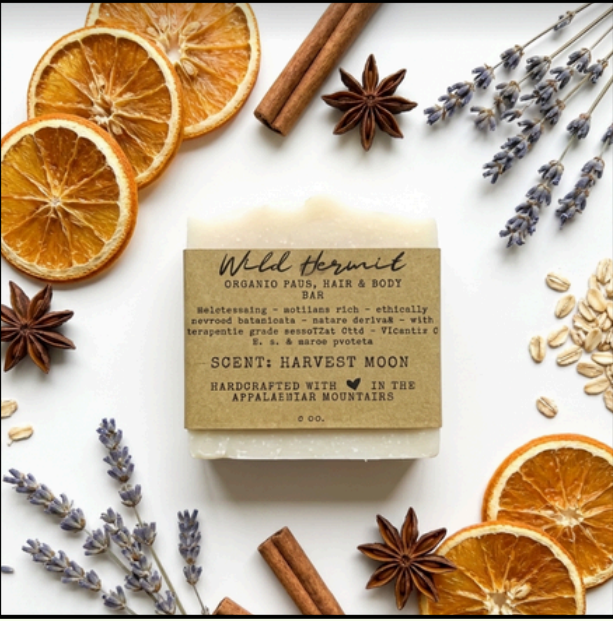
#59 HARVEST MOON MILK & TALLOW FACE/HAIR/BODY BAR SHAMPOO, 5.5 OZ.