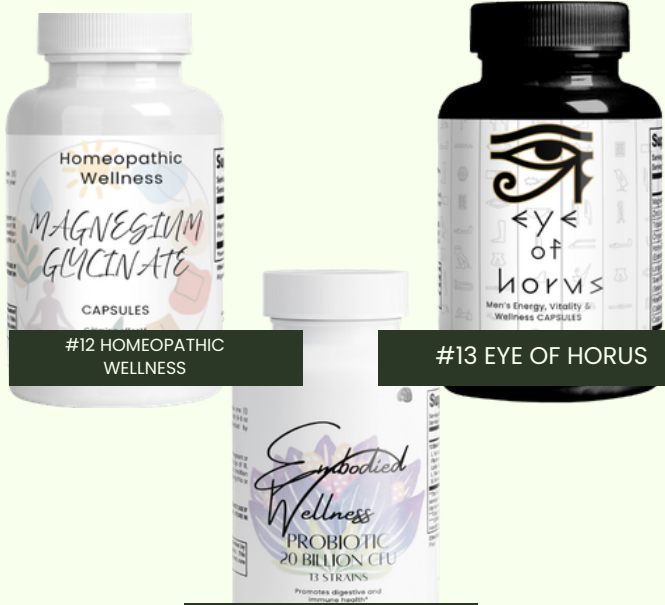
#12 HOMEOPATHIC WELLNESS