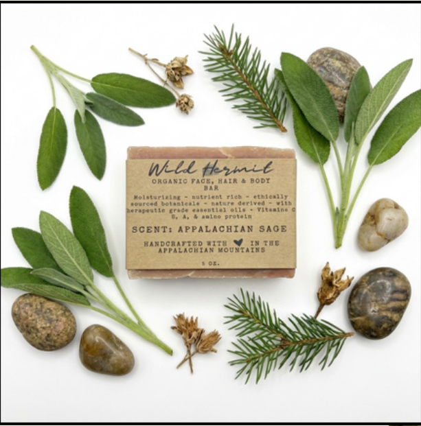
#59 APPALACHIAN SAGE FACE/HAIR/BODY BAR SHAMPOO, 5.5 OZ.

Minimum order quantity for ALL Bar Soaps are 48 units. Volume discounts & mix & match options apply at 100+ units. Price 4.50/bar. MSRP $8.99-16.99